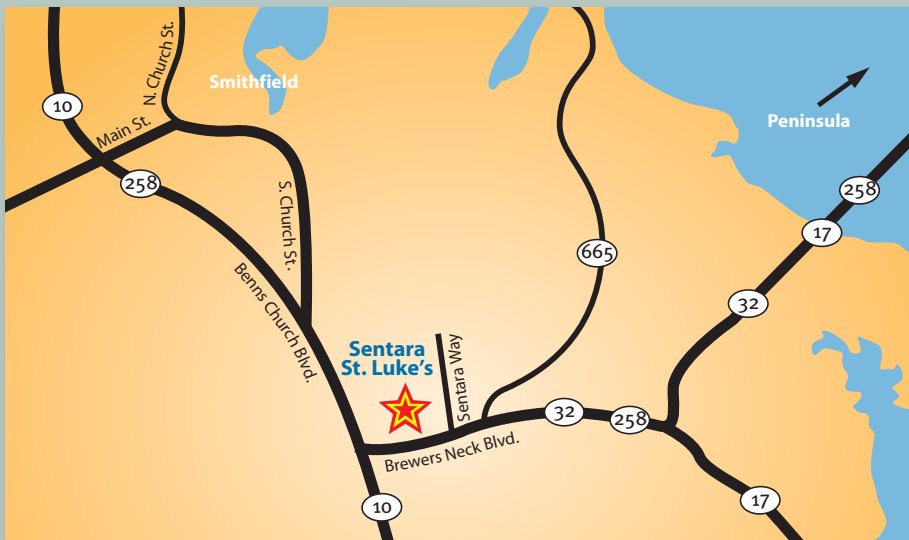
Located next to the former Smithfield Downs Golf Club.

S entara is committed to delivering quality care and outstanding customer service to all the communities it serves. The opening of Sentara St. Luke's and the prospect of future expansion, like the proposed Ambulatory Surgery Center currently under state review, are important steps in fulfilling that promise. Sentara St. Luke's will continue to add providers, services and capabilities in the coming months and years.