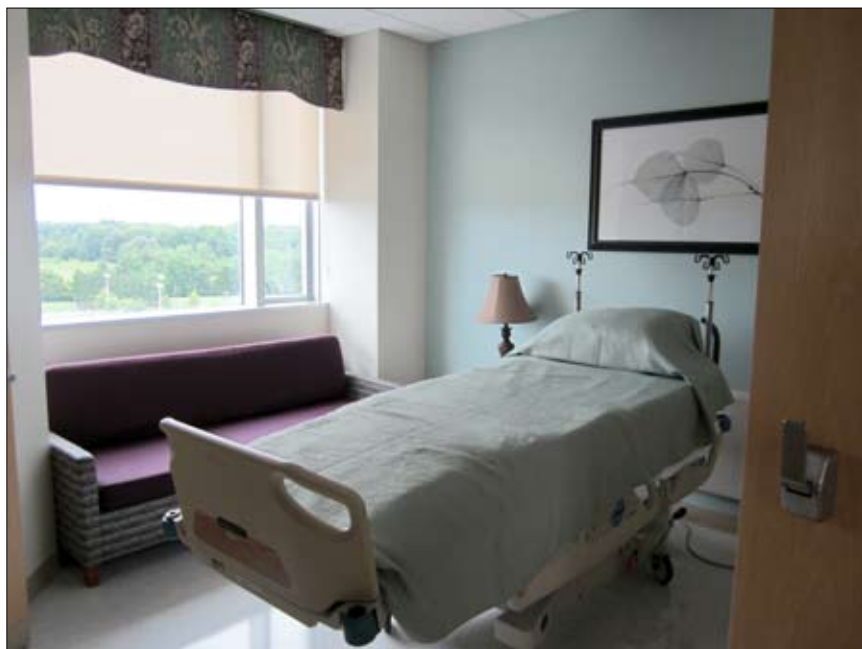
Sentara CarePlex Hospital Inpatient Hospice Unit patient bedroom. The colors and décor give the room a comfortable homelike feeling.