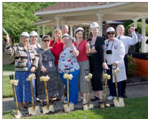
Staff celebrate the groundbreaking for the new Sentara Hospice House. Join in the celebration by logging onto www.Sentara.com/foundation or call us at (757) 455-7976 to learn more!